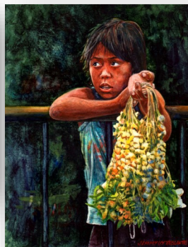
Sampaguita Vendor by Jimmy Tablante