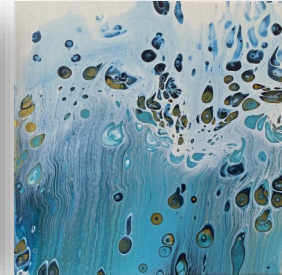
Falling Water by Liz Corbin

The Windward Wanderers will be showing at the Kalapawai Café & Deli in September.