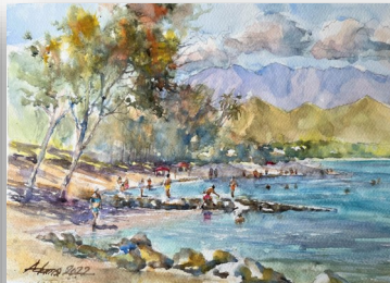
Perfect Day at the Boat Launch by Dwayne Adams